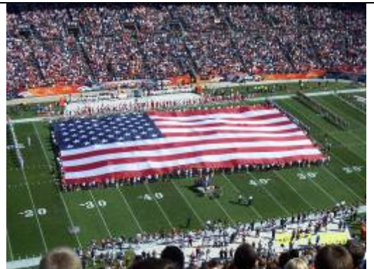
"Proud to be an American and a Broncos' fan"