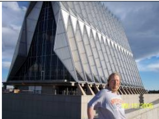
Air Force Academy Chapel, Colorado Springs