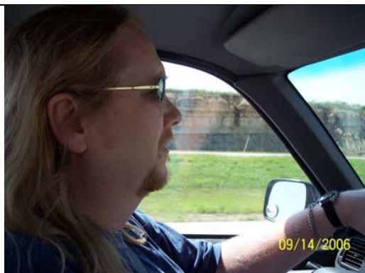
"Headin' west, on a mission to see the Broncos"