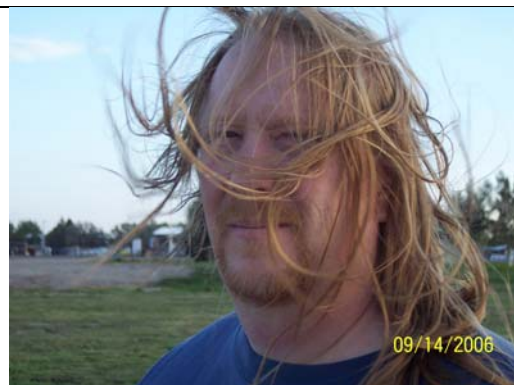
"Dang it is windy out here in Kansas"