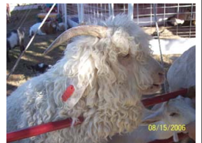
My kind of sheep

Midnight Country c/o KOPN 89.5 FM, 915 E. Broadway, Columbia, MO 65203